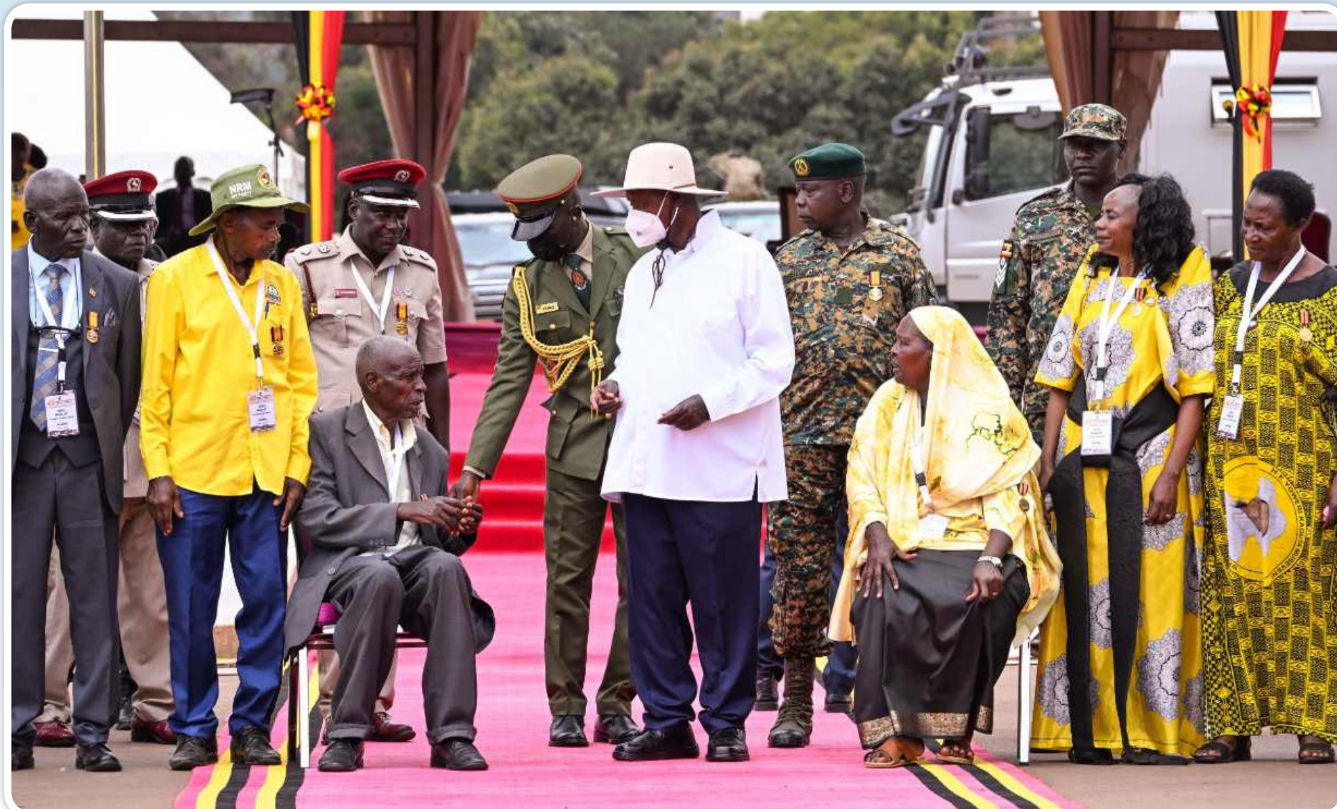
President Museveni poses for a photo with some of the officials who received medals.