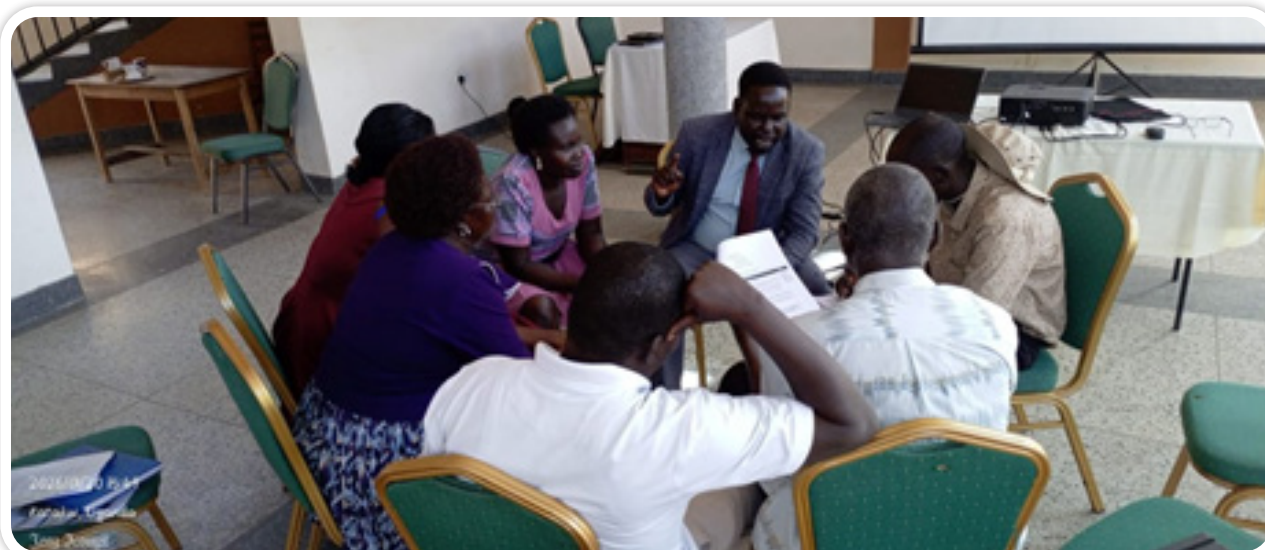
District leadership administering a questionnaire in a group discussion.

The community of Abela in Getom sub county, Magoro and Ongongoja in relation