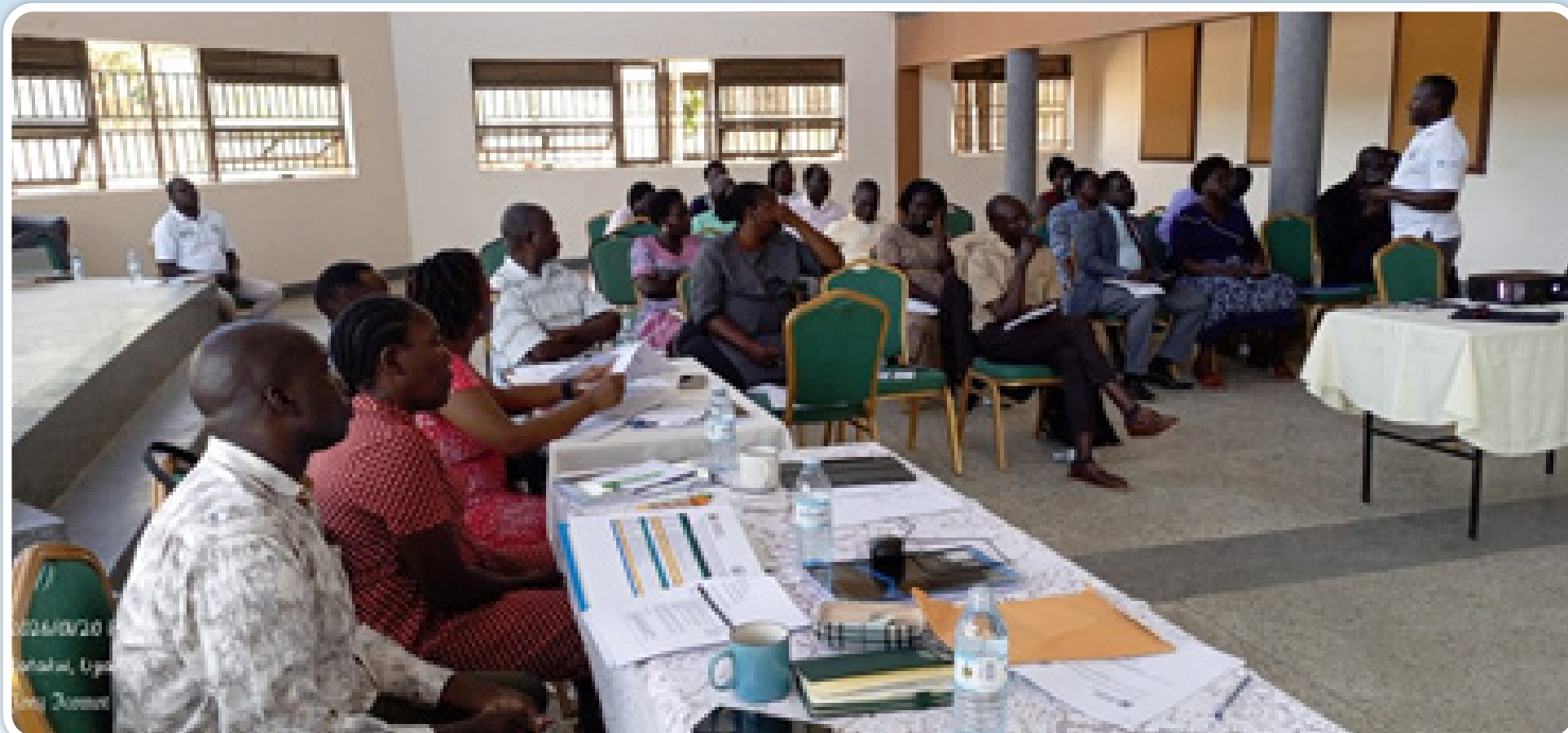
The first day of the sustainable land management engagement ground truthing exercise at the district Council chambers.

a soil science lecturer at Muni University, Arua, noted that increasing human pressure on natural resources has greatly affected the environment.