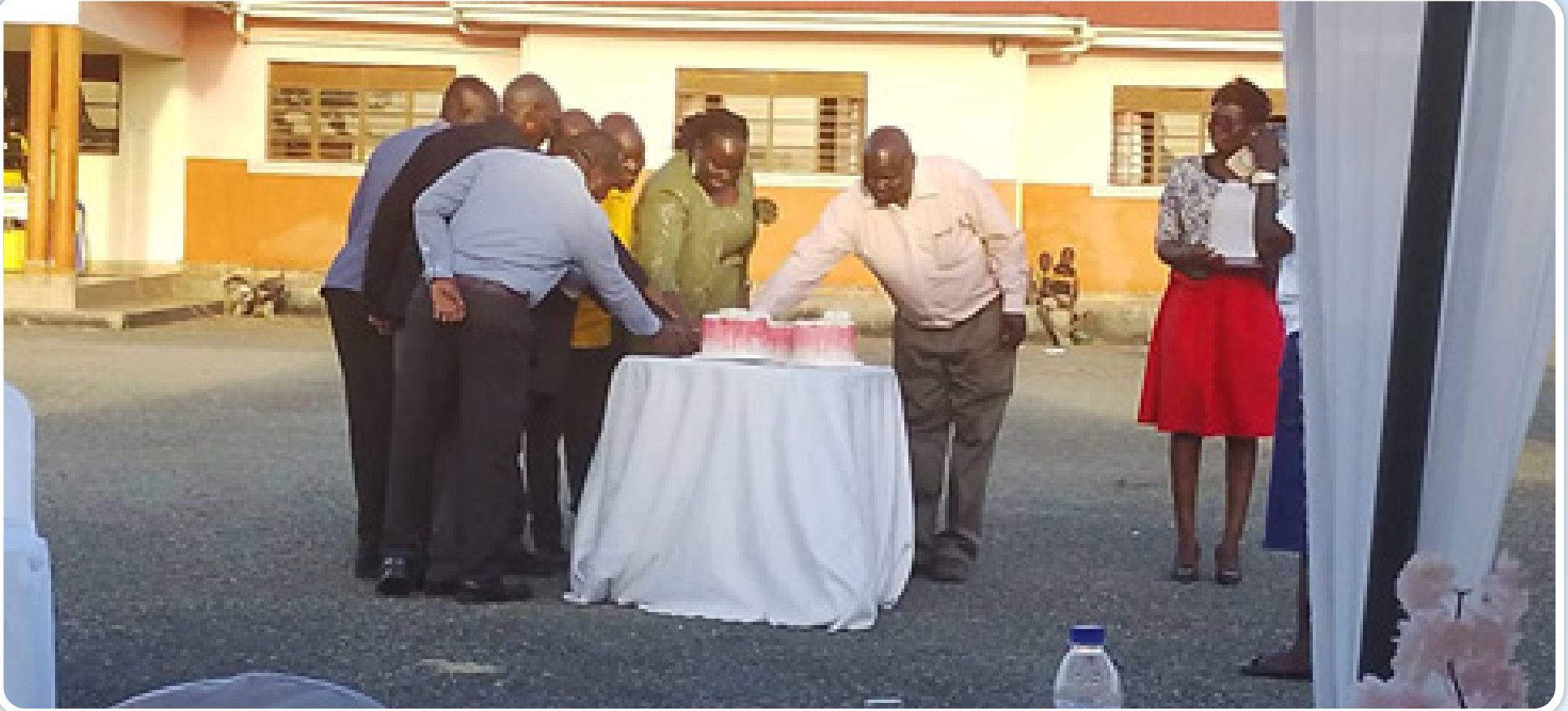
The new CAO and the outgoing CAO accompanied by other dignitaries cut the cake last week.