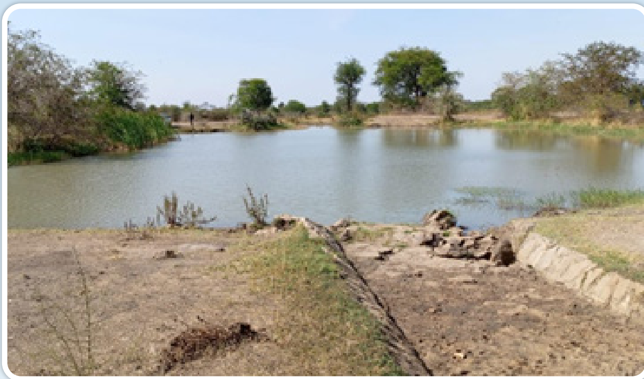
Part of the dam degenerating to a well due to degradation.

to land degradation and sustainable land use had a similar perspective with clear expression of immediate interventions to save the situation. They gave scenarios and life testimonies of indigenous vegetations and proper land use for example the communal land use which provided for animal paths, grazing land most interestingly communal crop production which is not the case now.