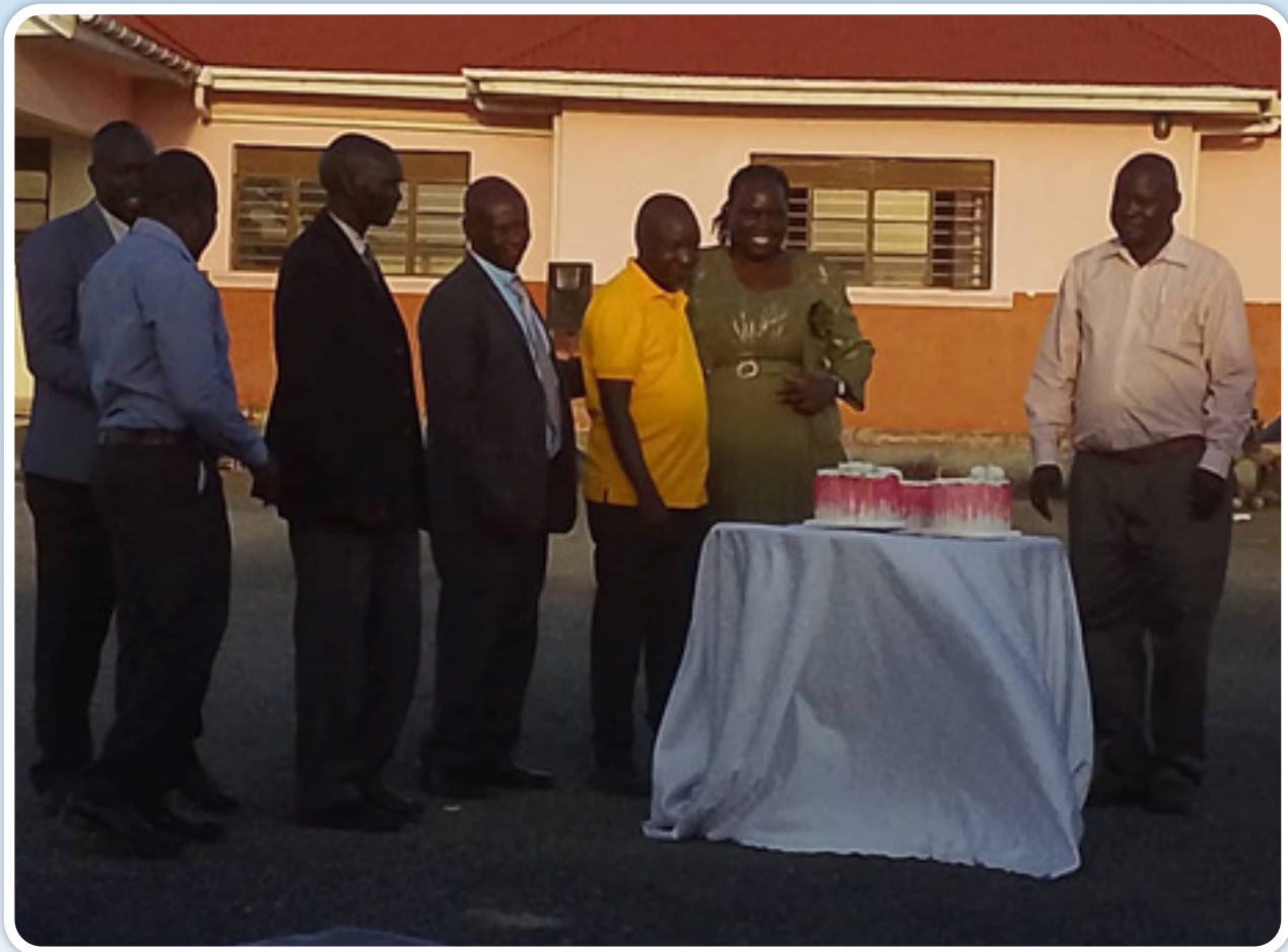
The new CAO and the outgoing CAO accompanied by other dignitaries preparing to cut the cake last week.