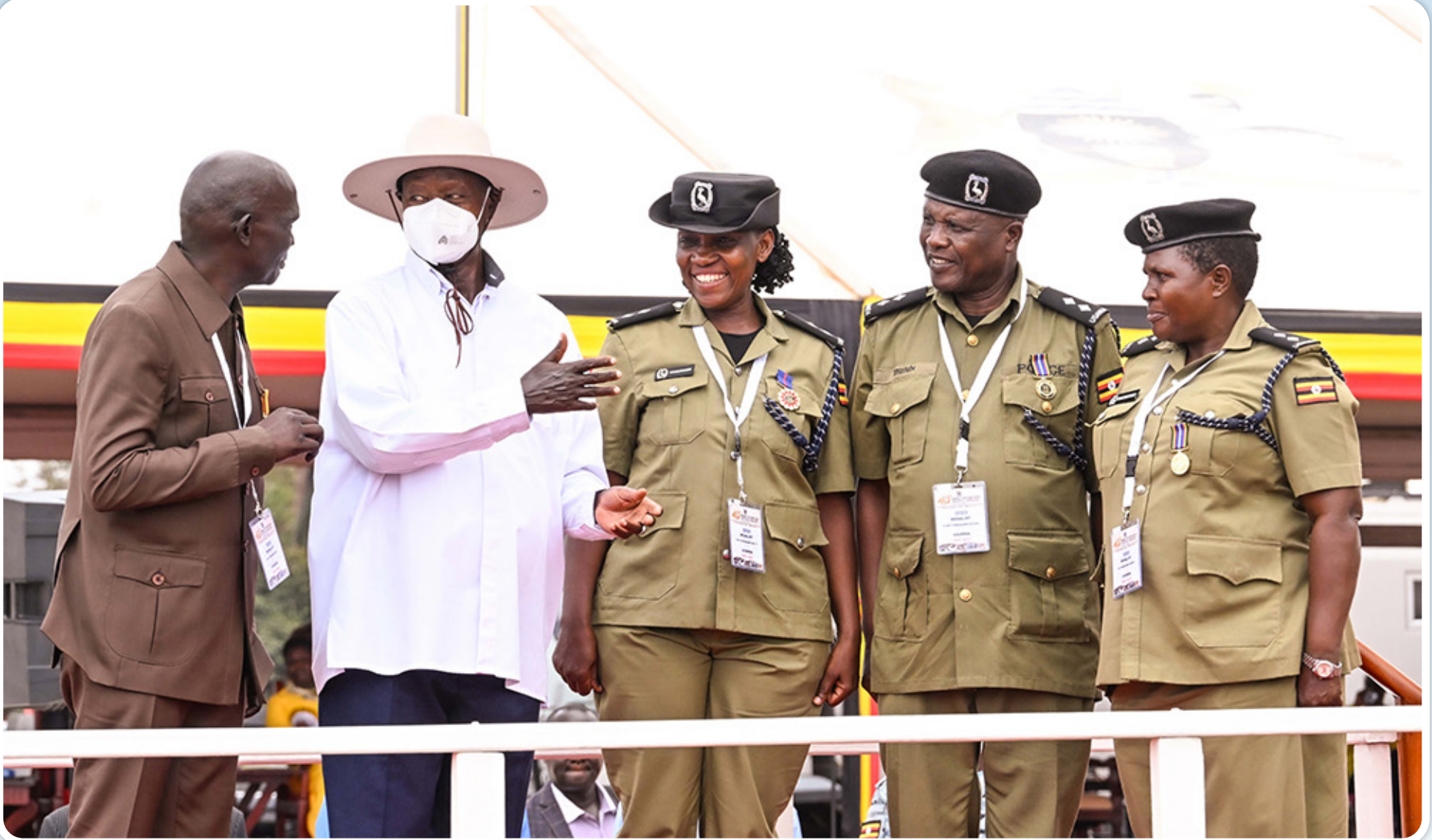
The President shares a light moment with some of the decorated officers in uniform.

unity, and strengthening governance discipline.