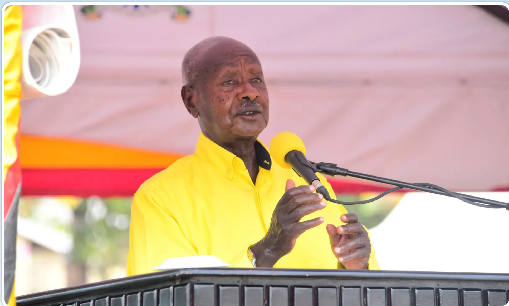
President Yoweri Museveni.