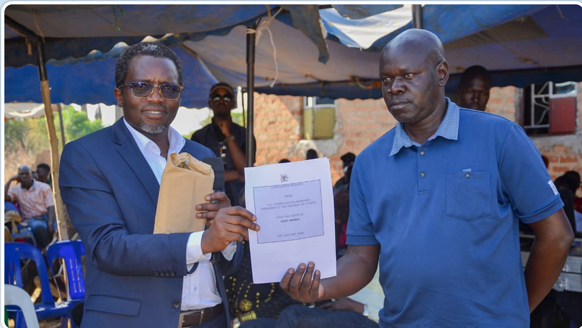
The Minister for Northern Uganda, Kenneth Omona (R) conveys his condolences on behalf of the President in Arapai, Soroti.

In a message read by the Minister for Northern Uganda, Kenneth Omona, President Yoweri Museveni expressed with profound, offering condolences on behalf of the Government and the National Resistance Movement (NRM).