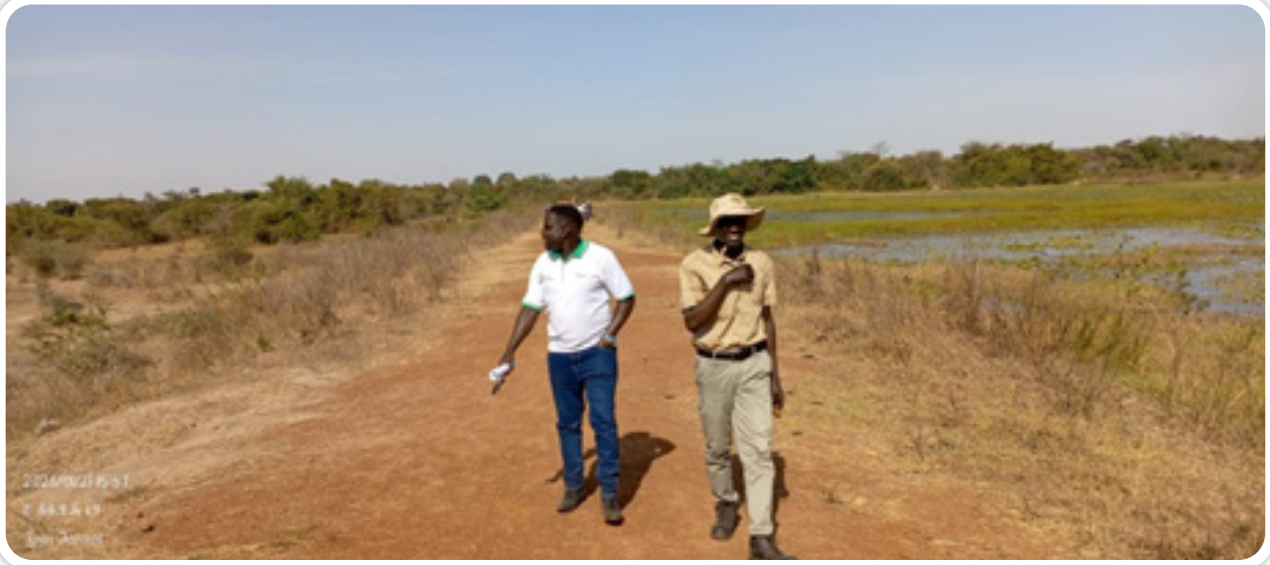
The Team, environment officer and Assistant Veterinary officer walk through an embarkment that supports the valley tank in ceele during the ground truthing field visit.

An engagement held on Tuesday, 20th January 2026, at the District Council Hall brought together a technical team from the Ministry of Agriculture, Animal Industry and Fisheries (MAAIF) and district leadership to generate strategies for restoring